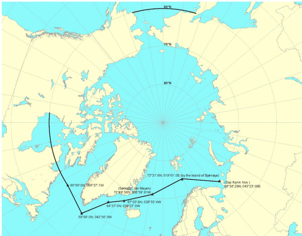
Figure 2 – Maximum extent of Arctic waters application 3